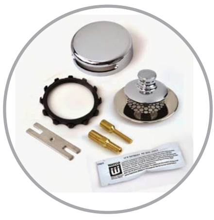
Everything is included to make old bathtub drains look new again.